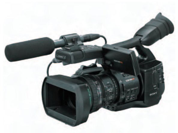
The shotgun microphone is an optional accessory