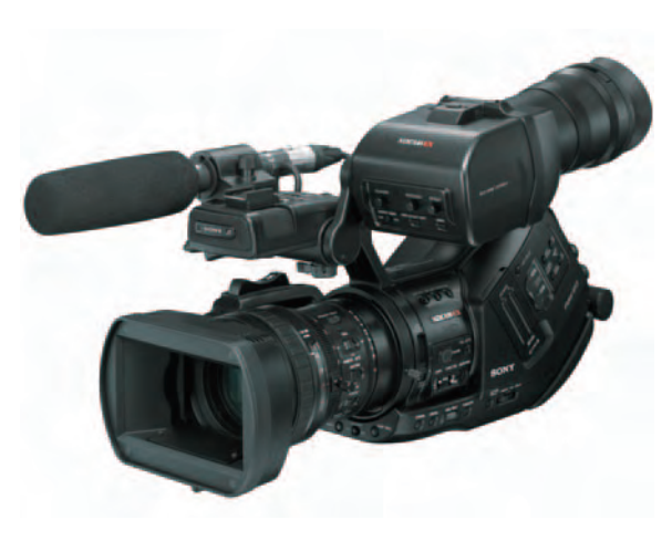
The shotgun microphone is an optional accessory.